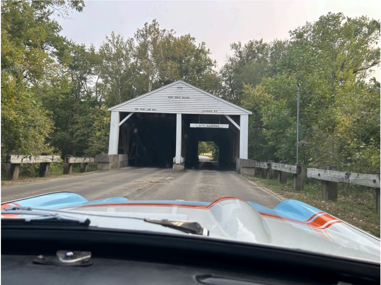
Crossing the 1838 bridge in a 1964 TR4

the last leg toward Nashville. We arrived at the Brown County State Park, crossing the double barrel covered bridge built in 1838, and were greeted at the lodge by more Minnesota Triumph members, plus a Renown, another TR250, a Spitfire and a Mini. Registered members at the event totaled 22 with another 3 that came to visit for a day.