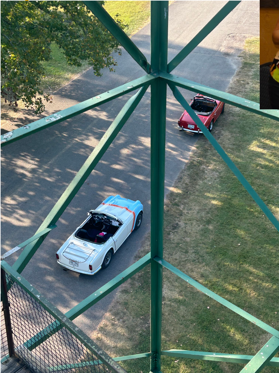
Triumphs from above, taking a break to see the view from a 90-foot tower.