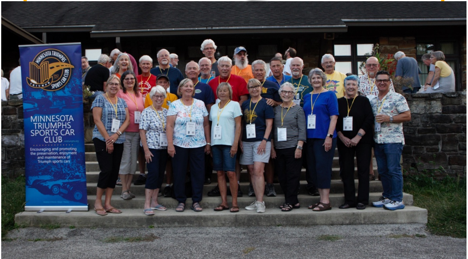
The MN Triumphs contingency

Save the date! Minnesota Triumphs are hosting VTR 2025 in La Crosse, Wisconsin! July 15-18, 2025