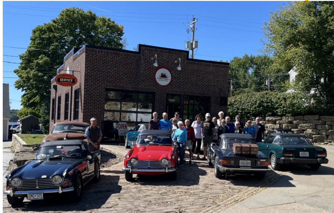
Triumphs outside of Antique Archaeology

Since we would pass only a mile from Antique Archeology, it