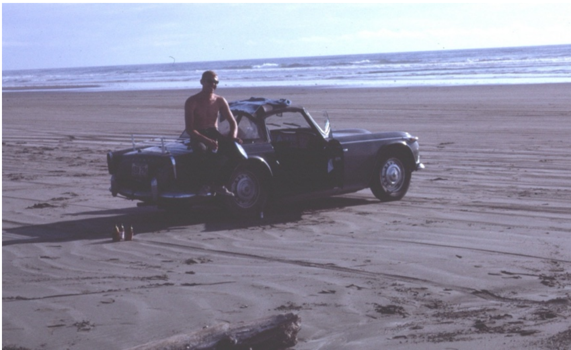
Ocean shores, prep for beach lesson

operators) ultimately led to the car resting on its frame. And the tide was coming in. Really. But in a brilliant flash of genius, I recalled the Old Indian Trick of letting most of the air out of the rear tires to get more traction. Turned out the Old Indian was right. After that close call, we of course picked up more beer to