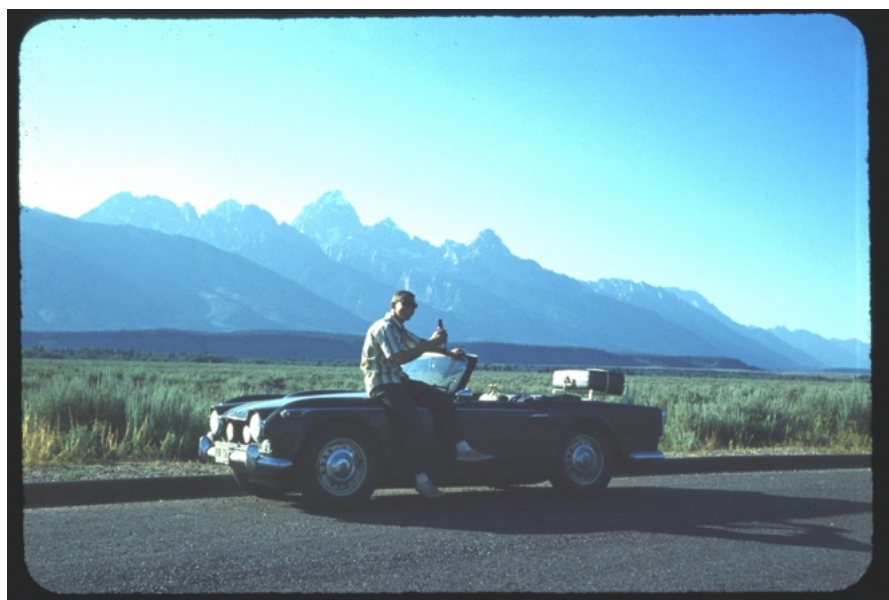
Grand Teton National Park

We left at O-Dark-thirty next morning, headed west across the Minnesota countryside in the beautiful cool morning. Then, top down, taking turns driving, cruised across North Dakota under 98 degree afternoon sun. Had the best cold beer I've ever had in my life in a dark little bar in Beach ND just before entering Montana.