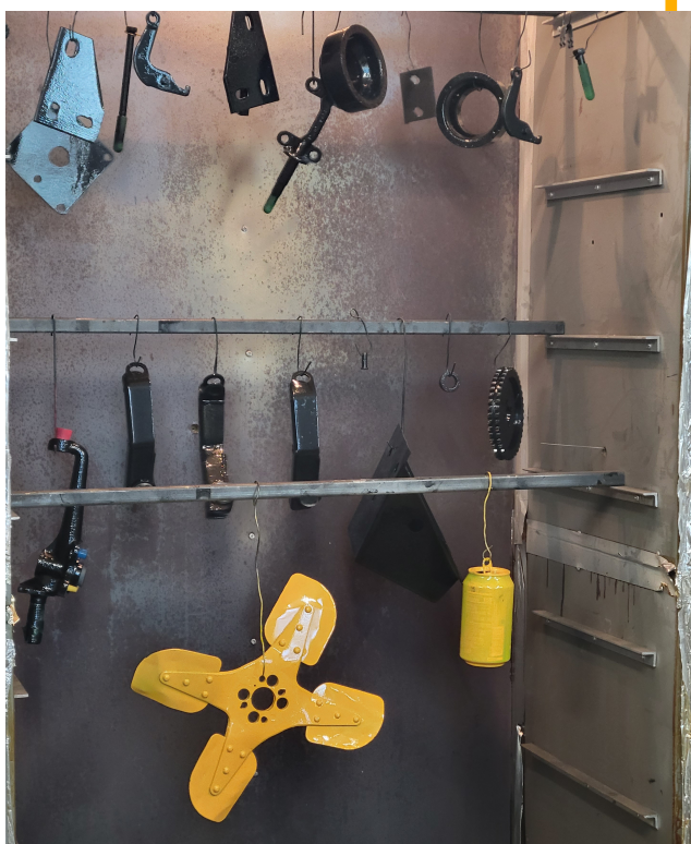
Completed parts after baking