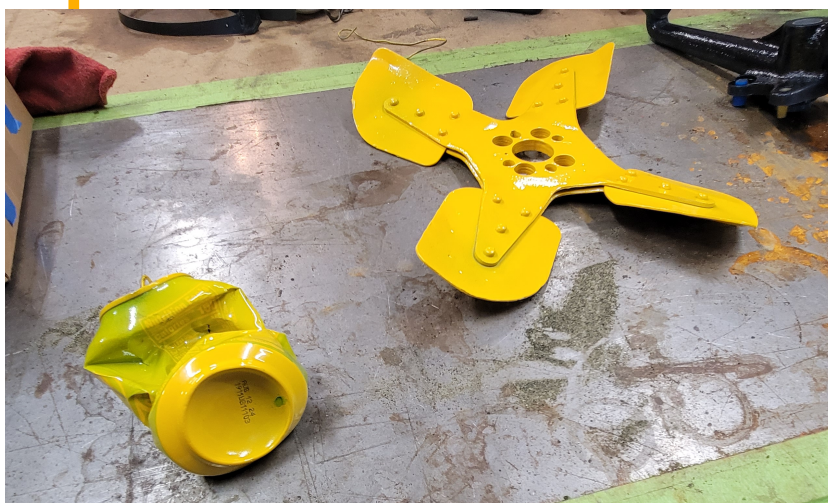
Crushing a powder coated pop can, the coating doesn't even crack!