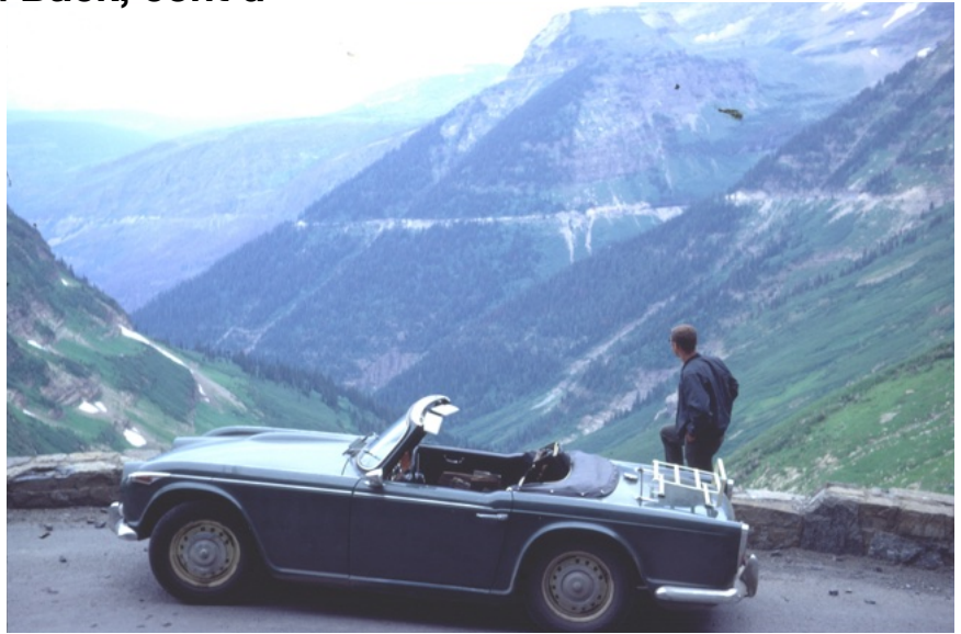
Glacier National Park, Going-to-the-Sun Road

Eventually, I had to point the car back east. Solo, except for a hitchhiking backpacker I picked up somewhere near Whitefish, and dropped off somewhere in Glacier NP. Note: Hwy 2 through Montana is 666 miles... (actually, Google says "The spiritual meaning of 666 is an encouragement to