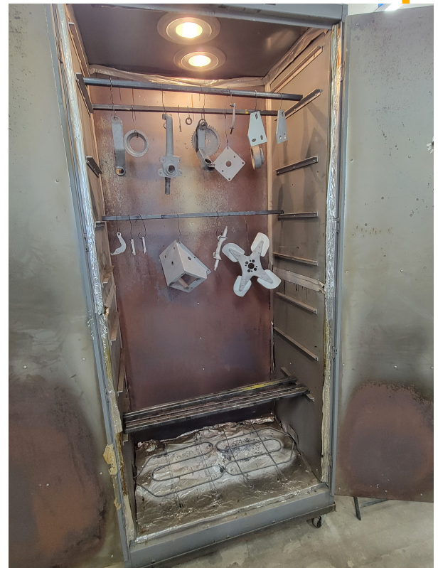
Baking parts for final cleaning before coating