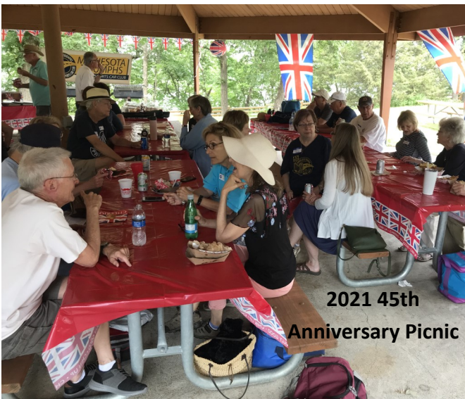
2021 45th Anniversary Picnic