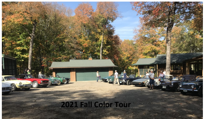
2021 Fall Color Tour