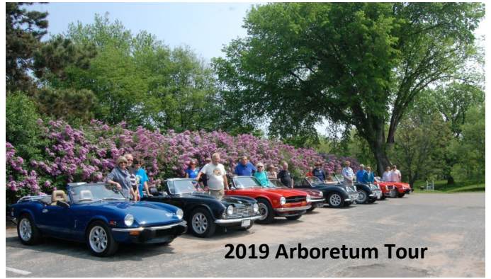
2019 Arboretum Tour