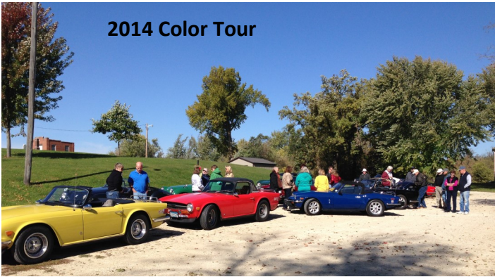
2014 Color Tour