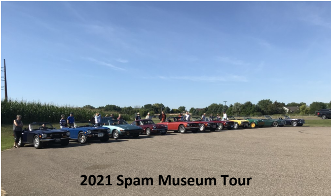
2021 Spam Museum Tour