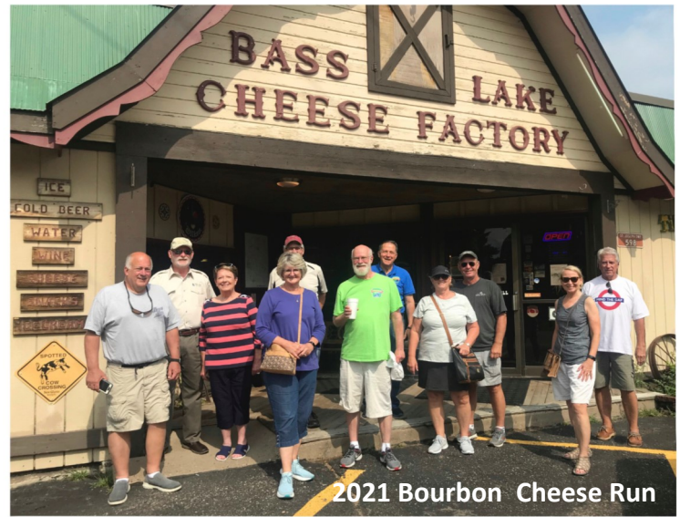
2021 Bourbon Cheese Run