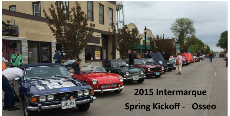
2015 Intermarque Spring Kickoff - Osseo