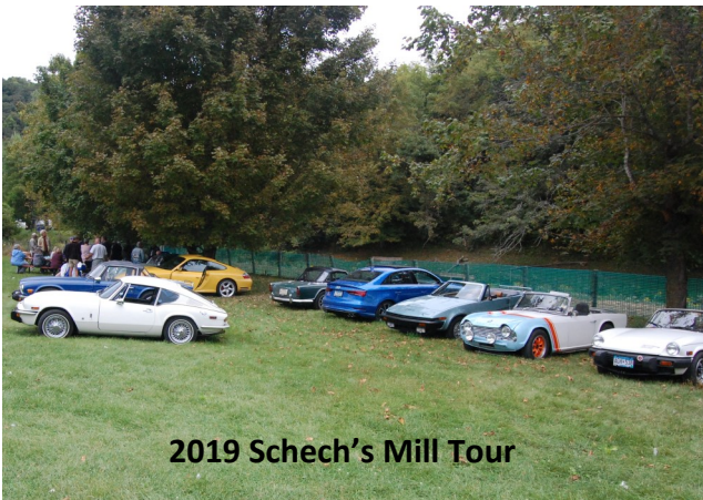
2019 Schech's Mill Tour