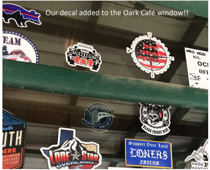
Our decal added to the Oark Café window!!