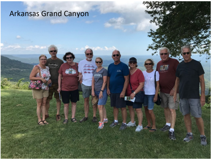
Arkansas Grand Canyon