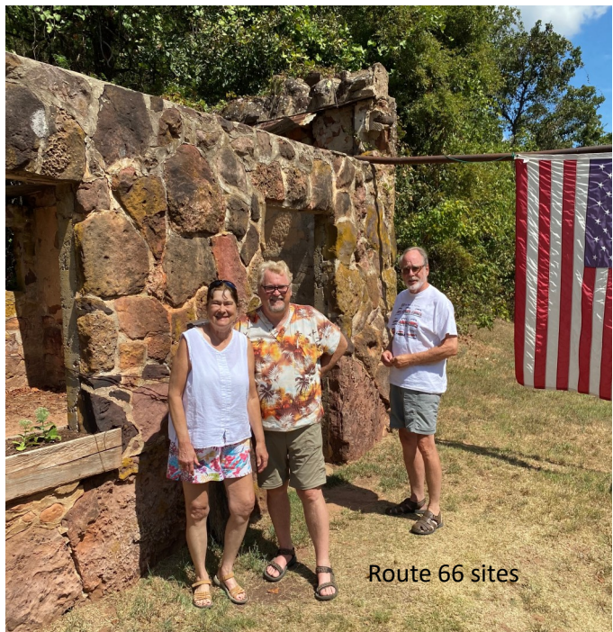
Route 66 sites