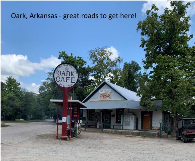
Oark, Arkansas - great roads to get here!