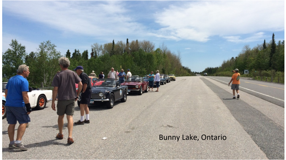
Bunny Lake, Ontario

By now, most of you will have abandoned your “new year’s resolutions”. If you held out until the 31 st you will have been 35 days short of the average time it takes to make a change a habit. I have never been one to make them. My thought is, if you need to make a change or do something new why not do it now? Furthermore, the word “resolution” comes from the word “solve” and don’t we really know how to solve most of the things we put on the list of “resolutions”? We really don’t need help solving the age-old problem of saving money or watching less TV. Spend less and turn off the TV, done! I think most would agree that if you have one thing in your life you need to change for the better, there may be more in the same closet that need to be cleaned out too! So my proposed