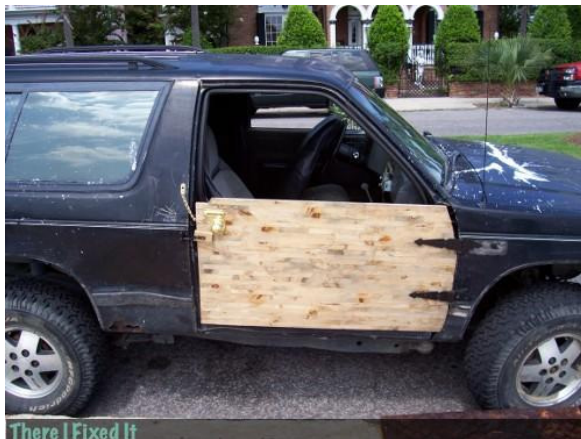
There I Fixed It