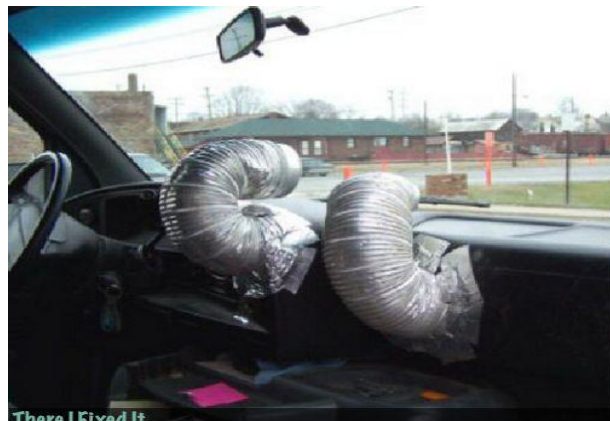
There I Fixed It