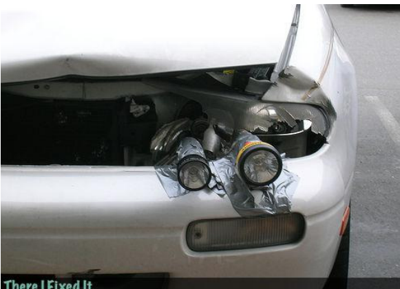
There I Fixed It