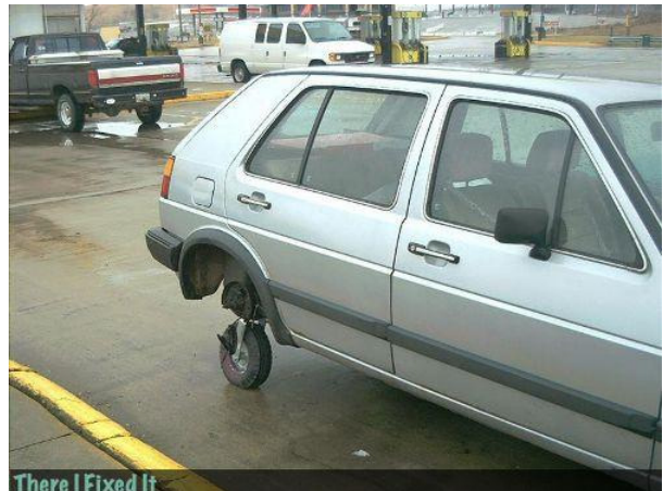
There I Fixed It