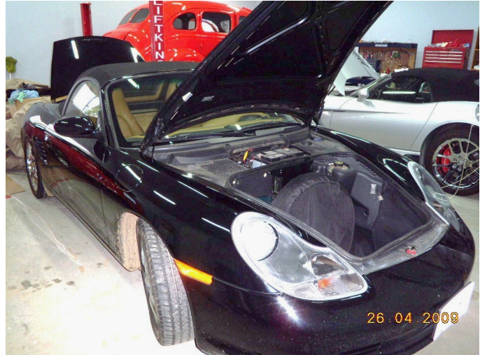
A selection of Bruce's stable