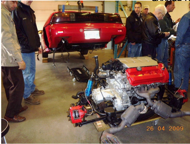
Dave's Fiero & motor