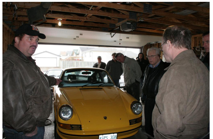
One of Clark's Porsches