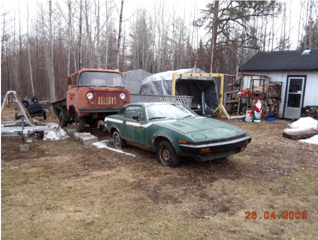
Norris' parking lot